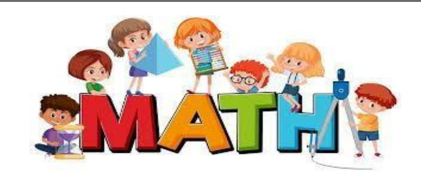
Package 3-Unit 3 Lessons 11–14 Unit 4 Lessons 16–19 Identifying factors and multiples, creating and continuing number patterns involving whole numbers, fractions and decimals

Package 5-Unit 6 Lessons 11–14, 16–17, 21–22 Imaginative texts Reading and interpreting a narrative poem Transforming poem into a multimodal narrative